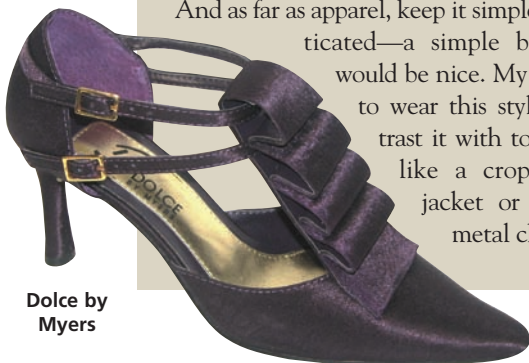
Dolce by Myers

This is such a fun, fanciful, feminine trend. These styles tend to be the focal point of an outfit, so add them to a look you want to spice or sass up. Sport this ruffle shoe the same way you sport an animal print—one item at a time, otherwise, it's going to be overkill. And as far as apparel, keep it simple and sophisticated—a simple black sheath would be nice. My favorite way to wear this style is to contrast it with tougher pieces like a cropped leather jacket or a tangle of metal chains.”