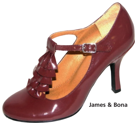
James & Bona

This season's selection of flirty sandals and pumps will have her searching for any reason to play dress up. Elie Saab paints the town purple in this sexy style with delicate ruffles for a bold, eye-catching statement. Ideal for a fancy dinner date or gallery opening, these shoes will make every occasion feel special. Ruffle by Dolce by Myers ($75), Tuxedo by James & Bona ($59.99), Lolita Ruffle Bag by Hayden-Harnett ($348), Elga by Nina ($99.95), Tamika by Badgley Mischka ($190) and Tuxedo hobo LH21/S by Lauren Henry ($630).